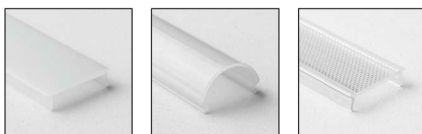
1 Satinato 4 Curvo 5 Prismatico